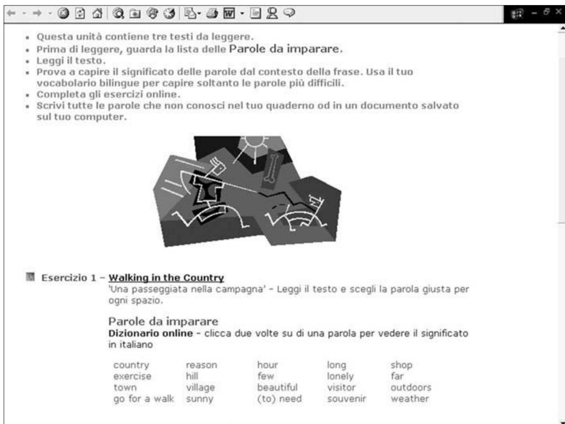
Figure 1 WebLingu@ Beginner level reading unit.

selects weekly activities from the WebLingu@ modules and coordinates them with small group interactive discussion tasks in English, as well as written homework in individual online journals. The participants are encouraged to consult with and help each other in the correction of written tasks, before the final drafts are corrected by the tutor, with appropriate feedback. It is also essential that the tutor plays the part of a facilitator who sets attainable objectives and structures clear weekly tasks that tie the materials in WebLingu@ together with asynchronous online discussion and f2f lessons.