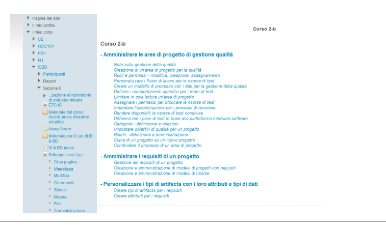
Fig. 1 - The wiki for the development of courses for Jazz-Hub

One student of Software Engineering was assigned to each of the above themes. The three students were coordinated by a graduating student and by the authors. The tool used for the initial composition of the course was a wiki, as illustrated in Fig. 1.