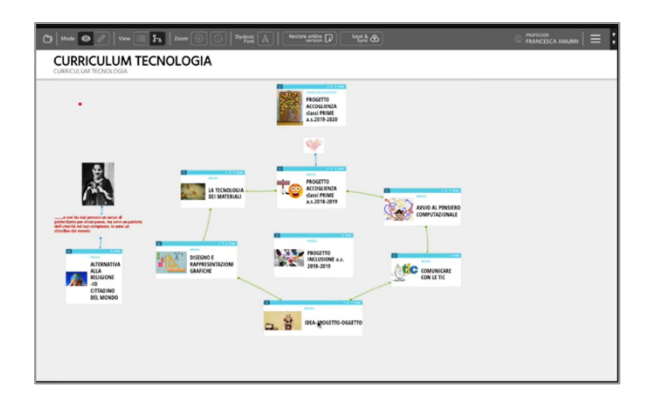
Figure 2 - Example of a micro level map.

also acts as a design artefact, as a support during the action, and for documentation.