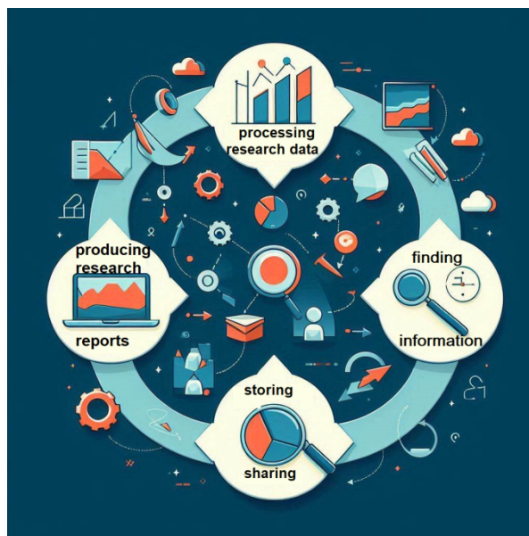
Figure 1 - Scree Plot Graph. Own elaboration in Co-pilot.

The model proposed by Guillén-Gámez (2023) has a base pillar consisting of skills related to: finding the information necessary to conduct research, processing research data, producing research reports both addressed to professionals and research communications of a journalistic nature. Below is an infographic showing the research model used in the article.