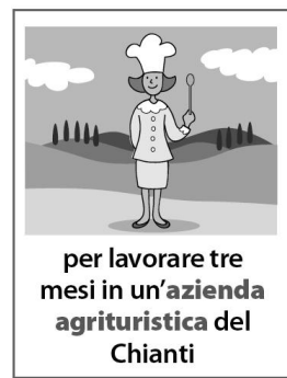
Fig. 2 – Three example pages of an MMS message [Screenshot 1: In 2007 a young cook from Bordeaux, Screenshot 2: received Leonardo programme funding; Screenshot 3: to work for three months in an agritourism company in the Chianti region]