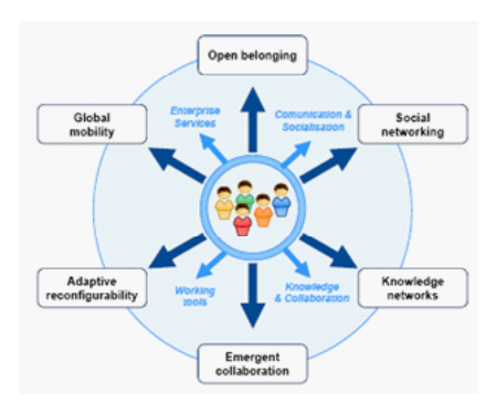
Fig. 1 - Education 2.0 framework

We modelled the emerging needs of learners from the emerging needs of knowledge workers 2.0. These needs can be divided into six key dimensions (Fig. 1): open belonging (secure and selective access to information, tools and connections that go beyond the institutional boundaries, interacting in an increasingly rich and effective manner with networked players); social networking (learners increasingly need to develop and maintain that network of relations that is becoming a more and more important asset for their professional efficiency); knowledge networks (learners must be able to build their own network to have access to knowledge and information from different sources, both explicit - document management systems, video-sharing, pod-casting, RSS -, and implicit - systems that ease interaction between experts, such as forums, mailing lists, surveys, blogs, folksonomies, wiki); emergent collaboration (learners need to create cooperative settings in a fast, flexible way, even outside the formal organisational patterns); adaptive reconfigurability (students need to quickly reconfigure their own processes and activities); global mobility (ubiquitous access to one's own network of tools, thus making the workspace and working time more flexible).