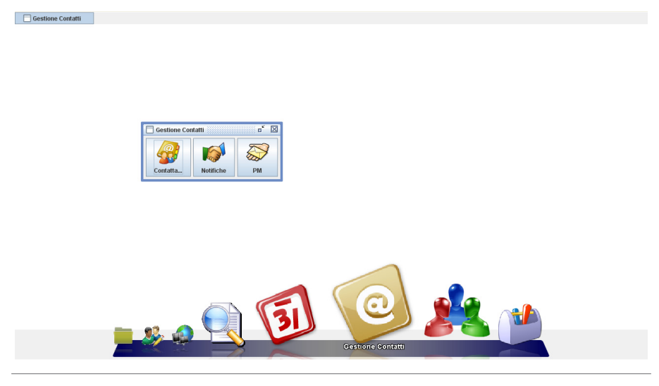
Fig. 2 -: Co.S.M.O.S. - Client Side

The client side of Co.S.M.O.S. offers three operating environments: "Personal", "Collaborative" and "Social". It presents an applet that is embedded in a web page and simulates a typical desktop of the most popular operating systems currently used (Figure 2, Figure 3).