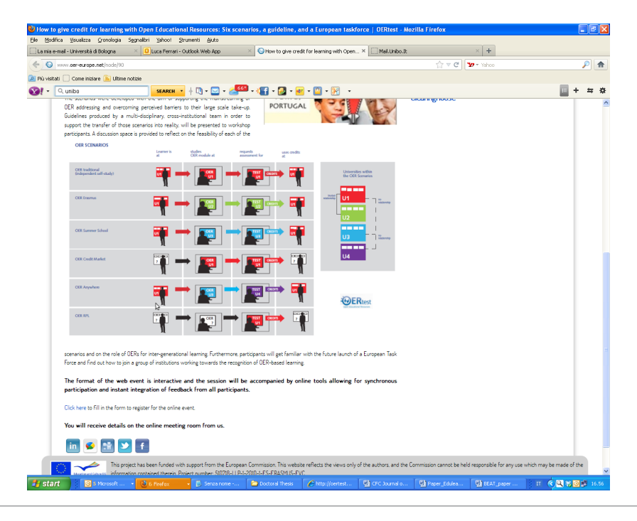
Fig. 1 - OER Scenarios

The scenarios (Figure 1) were developed with the aim of supporting the mainstreaming of OER, addressing and overcoming perceived barriers to their large scale take-up. Guidelines produced by a multi-disciplinary, cross-institutional team in order to support the transfer of those scenarios into reality, is being finalized (a discussion space through periodic webinars is provided to reflect on the feasibility result of each of the scenarios - example: http://www.oer-europe.net/node/90)